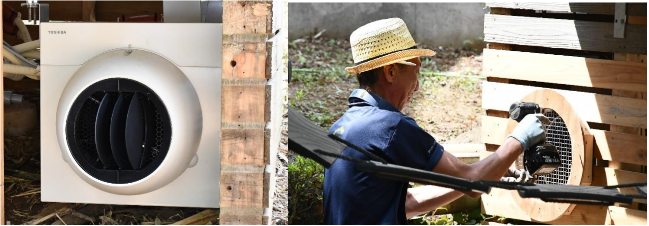
Installation of the FLEXAIR at Chiba Zoological Park.