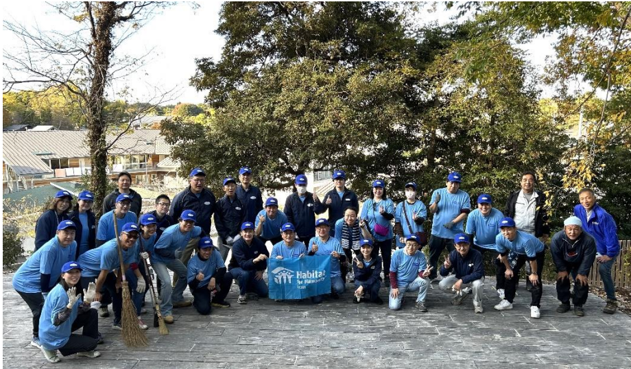
Group photo of Carrier volunteers with HFHJ team