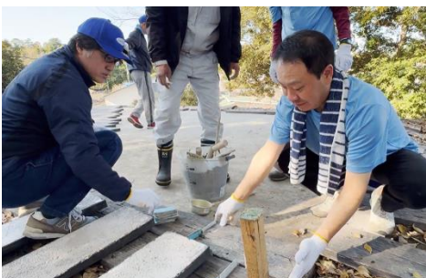
Tiling the stage surface