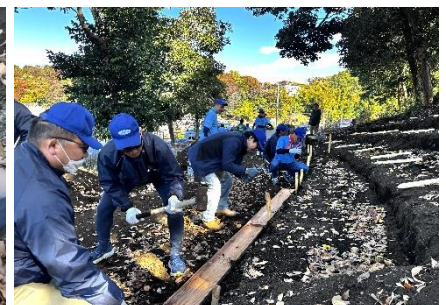
Creating terraced flowerbeds on the slope